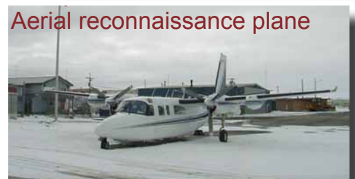
Aerial reconnaissance plane

HARVEST: Radio-tagged walrus are safe to eat: no drugs are used to deploy the tags. If you do harvest a radio-tagged walrus, please help us by returning the tag and providing information on the location and condition of the animal. If you have any questions, please contact